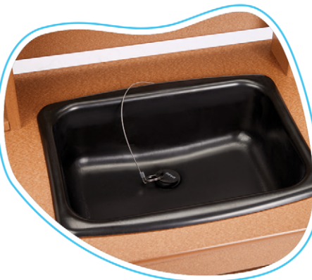
Stain-resistant, non-porous, and easy to clean